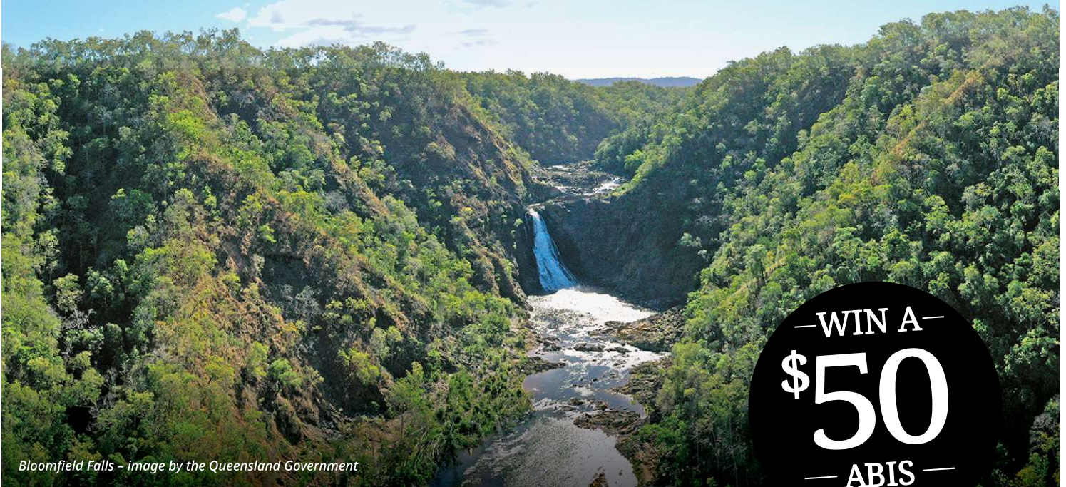
Bloomfield Falls