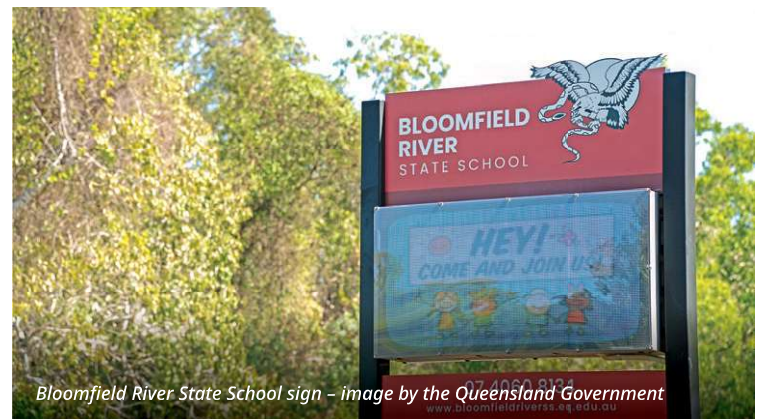
Bloomfield River State School sign