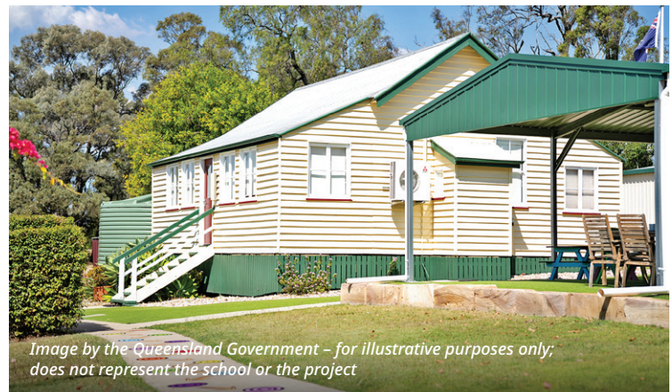
Image by the Queensland Government – for illustrative purposes only; does not represent the school or the project