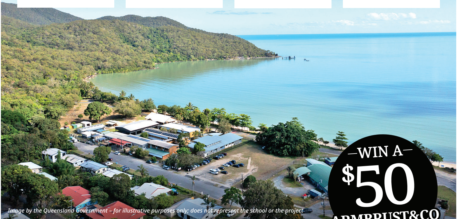
Image by the Queensland Government – for illustrative purposes only; does not represent the school or the project