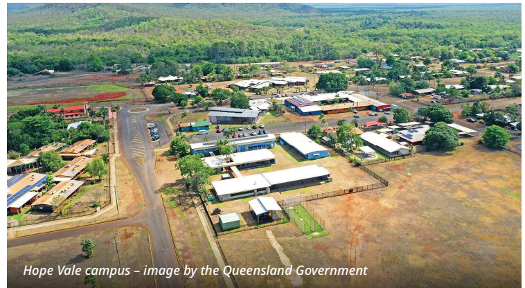
Hope Vale campus