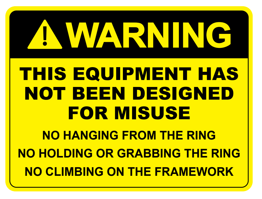
Figure 2: Warning sign